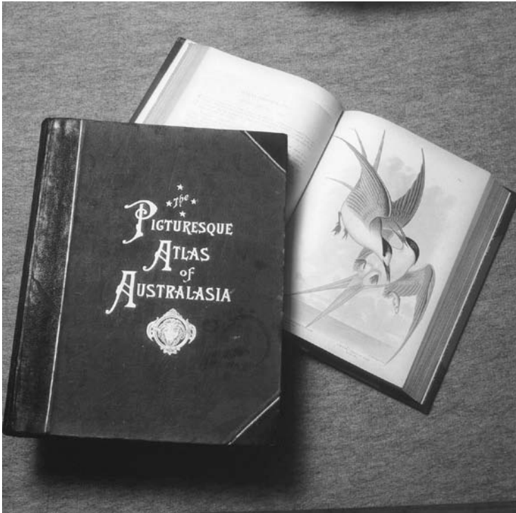
Garran's Picturesque Atlas of Australasia, one of three volumes published London 1886