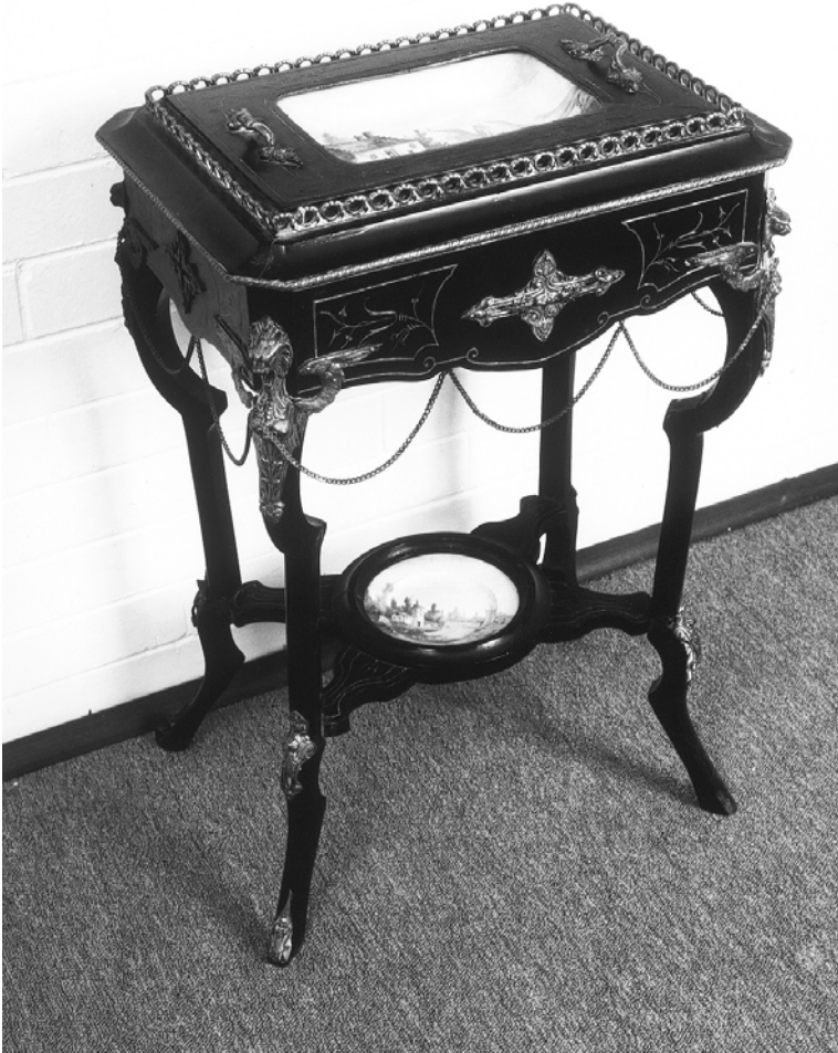
Large Victorian lacquered jardiniere with hand painted porcelain bowls