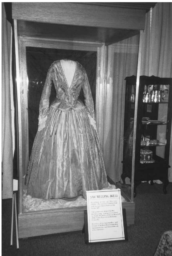
The Harriet Saw Wedding Dress 1852