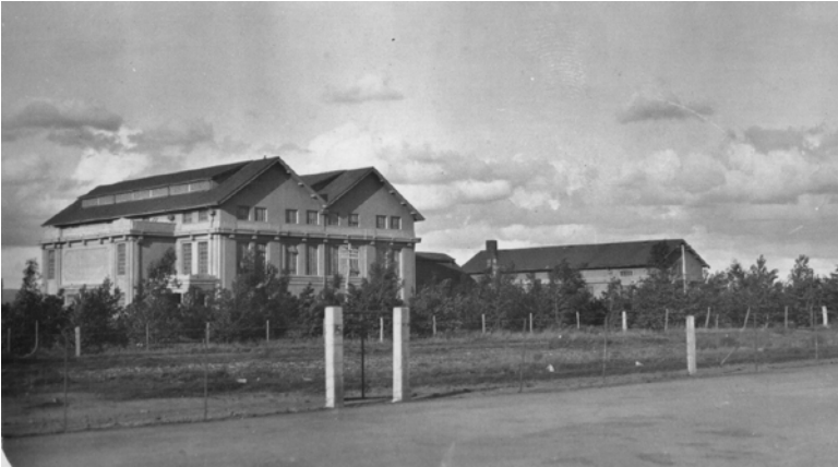
Powerhouse, Kingston Foreshore, ACT

community projects that promote and maintain residential precincts, and educational activities such as workshops, seminars and exhibitions.