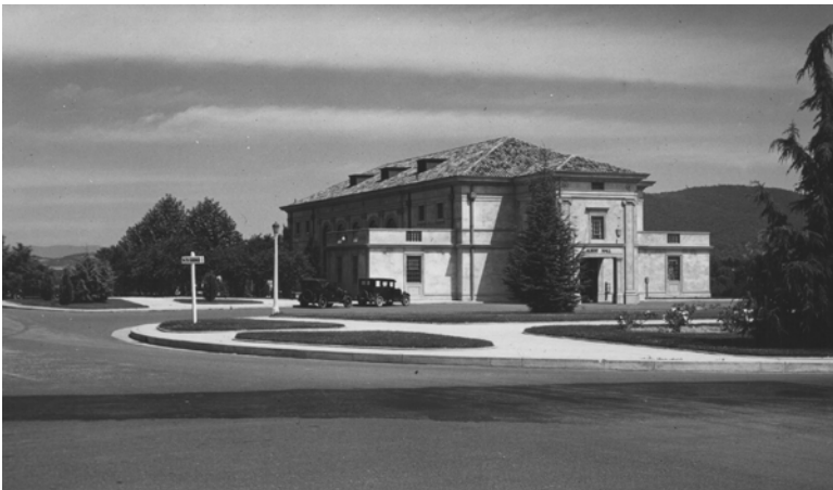
Albert Hall Canberra ACT

The Heritage Council advises the Minister on all heritage matters in the ACT including nominations to the Australian Capital Territory Heritage Places Register. However, the Council is responsible for the Register. The Heritage Office, Environment ACT, provides administrative and operational support to this Heritage Council.