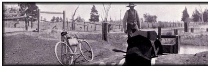
Measuring Water to the Irrigators