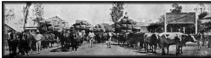
Bullock teams hauling wool, Charleville