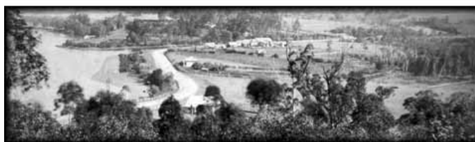
View over Newstead from Hamilton Hill, Queensland, 1873