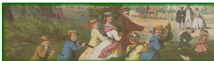
Christmas in the bush