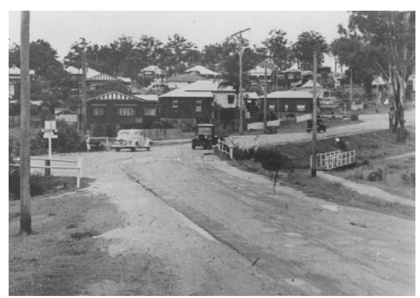
Fig 7: State Library Queensland, Vehicles on the road at Annerley, ca. 1935

A history conference is being held on Saturday 27 February 2016 at the Marymac Community Centre 616 Ipswich Road, Annerley (adjacent to Our Lady's College)