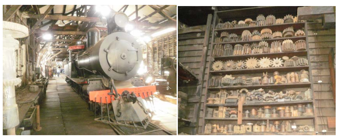
Fig 1: locomotive; Fig 2: shelf of wooden patterns

On the night of Thursday 7 January 2016 a ferocious bushfire all but destroyed the town of Yarloop some 130 kilometers south of Perth. Two elderly residents died and 128 houses were destroyed, as were the heritage listed Yarloop workshops and steam museum.