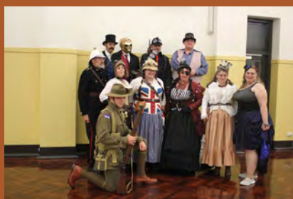
Dressing Up Launch

This year's History Festival was the biggest ever, with around 127,500 visits to 629 events presented by 366 different event organisers during May 2016.