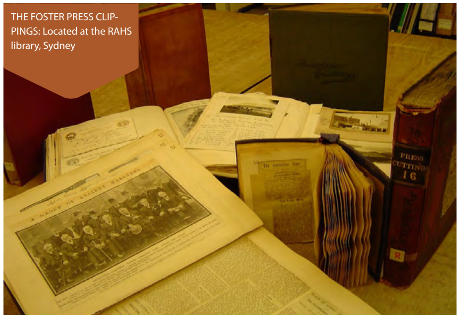
THE FOSTER PRESS CLIPPINGS: Located at the RAHS library, Sydney

'The Foster albums are amazing in their content. Those of us who have had the pleasure of browsing them, cannot put one down without finding some treasure'