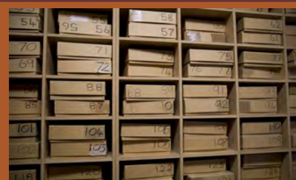
RHSV Documents Collection Storage

Combined, our society collections contain millions of items of moveable cultural heritage and therefore form a significant component of Australia's 'Distributed National Collection'