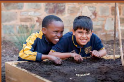
Kilkenny Primary Students