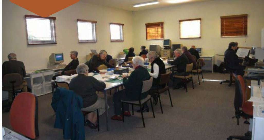
WOODEND RESEARCH ROOM: Woodend and District Heritage Society Inc.

Society collections are used by both their volunteer members and researching visitors, contributing towards hard copy and online publications, DVDs, Web pages, Facebook pages and other types of presentation about their locality and its people. They also provide information for individuals and organisations, such as local councils, that pursue a wide range of projects that require an understanding of past developments within a community. I know of many tertiary students and postgraduates who have used society collections, which is