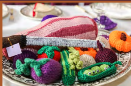
All Wrapped Up for Winter