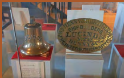
Items from the Lucinda on display