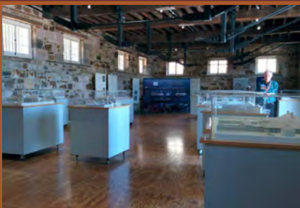
The Commissariat Store Museum