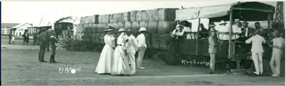
Wool train - Roebourne to Cossack, RWAHS P1999.4260

Our Museum, Library and Photograph collections are now online. You are invited to explore them.