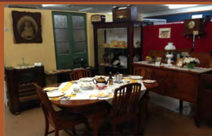
Townsville Historical Society